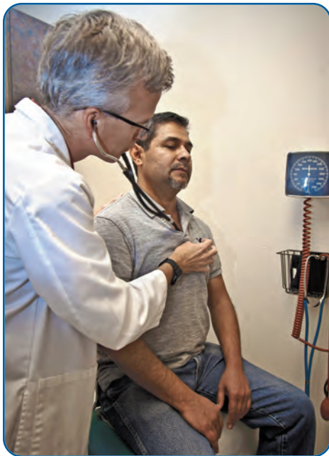
"God Provides" from front